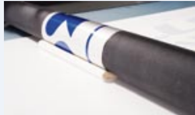
Fast and precise dry and cold application to surface.