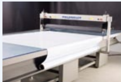
Practical side pockets for banner or flex-face application.