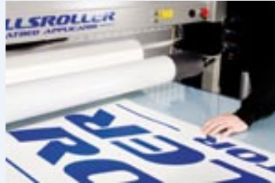
Easy to apply from roll to substrate.