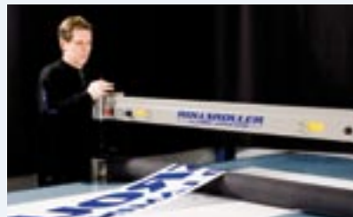
Ergonomic working height. RollsRoller is available in height-adjustable version.